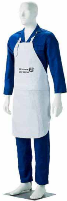
ACE 2 PIECE APRON